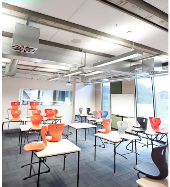
Goodman Feilder—Training Room