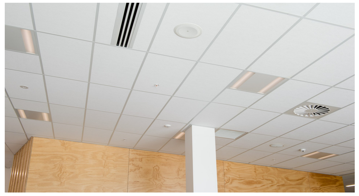
Photo: Triton 50HD, 600 \times 1200 \text{ panels in Rondo Donn}^{\$} grid