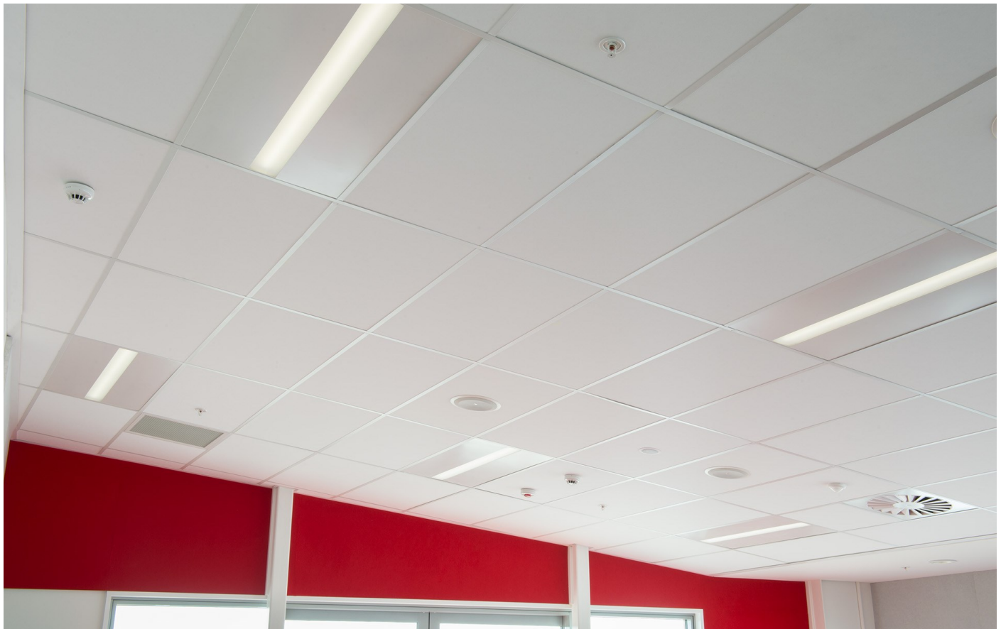
Photo: Haeata community college classroom