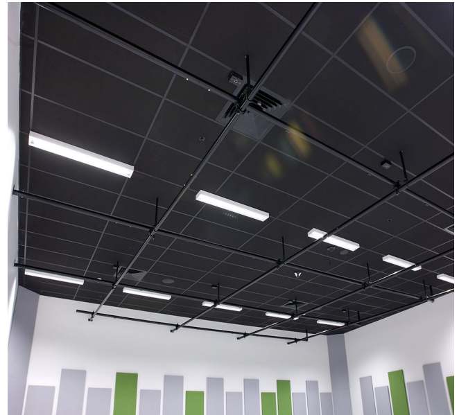
Photo: Hobsonville Point Secondary School, Triton 25 with black Sonatex facing