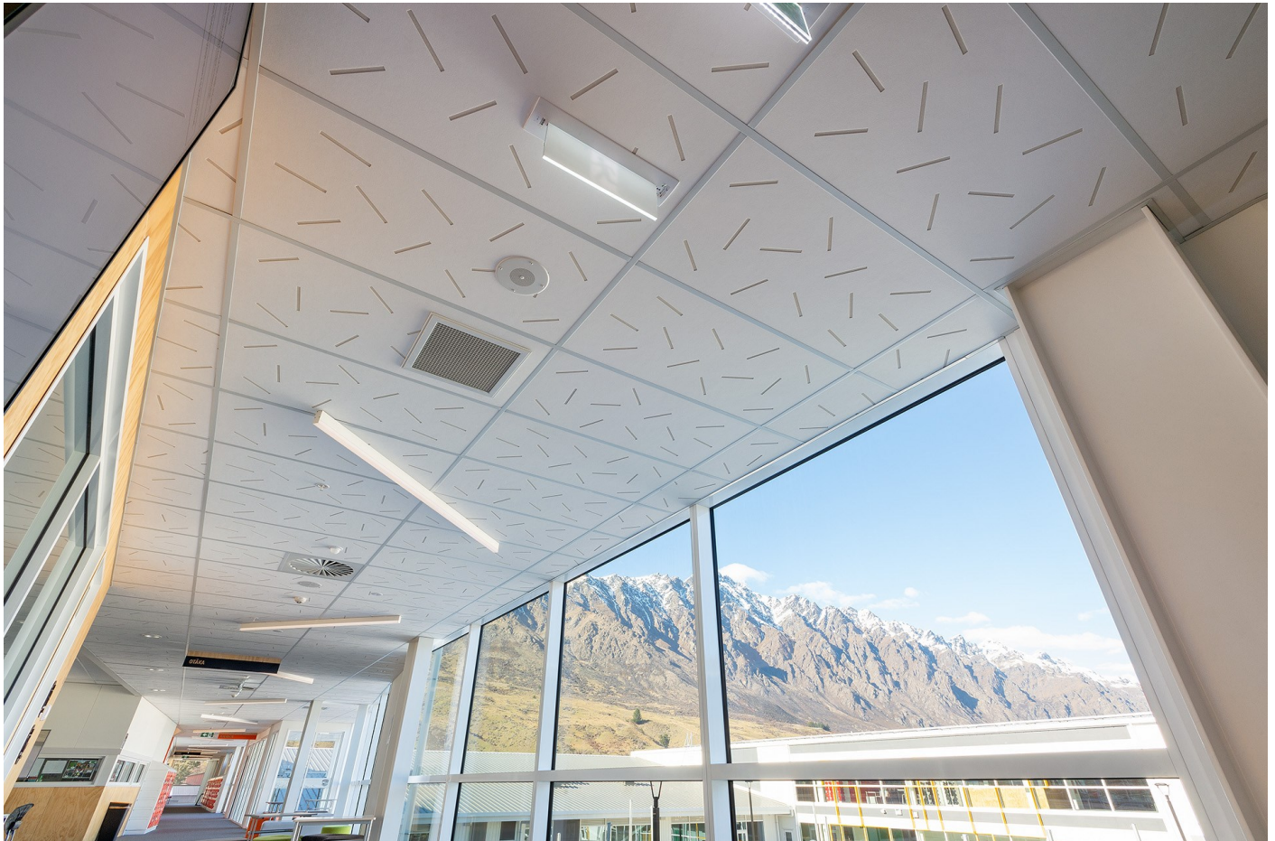
Photo: Wakatipu School, Triton 25, 600 x 1200 with Sonaris random slot perforated finish