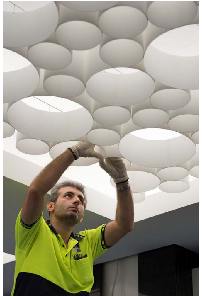
Installation of AO-Gami tubes in ASB Queen Street Branch

Supply and install AO-Gami™ acoustic paper tubes to (ceiling) as supplied by Asona Ltd Tel: 09 525 6575 Fax: 09 525 6579, # ( ), cell type (small) (medium) (large), Finish (natural), Colour ( )