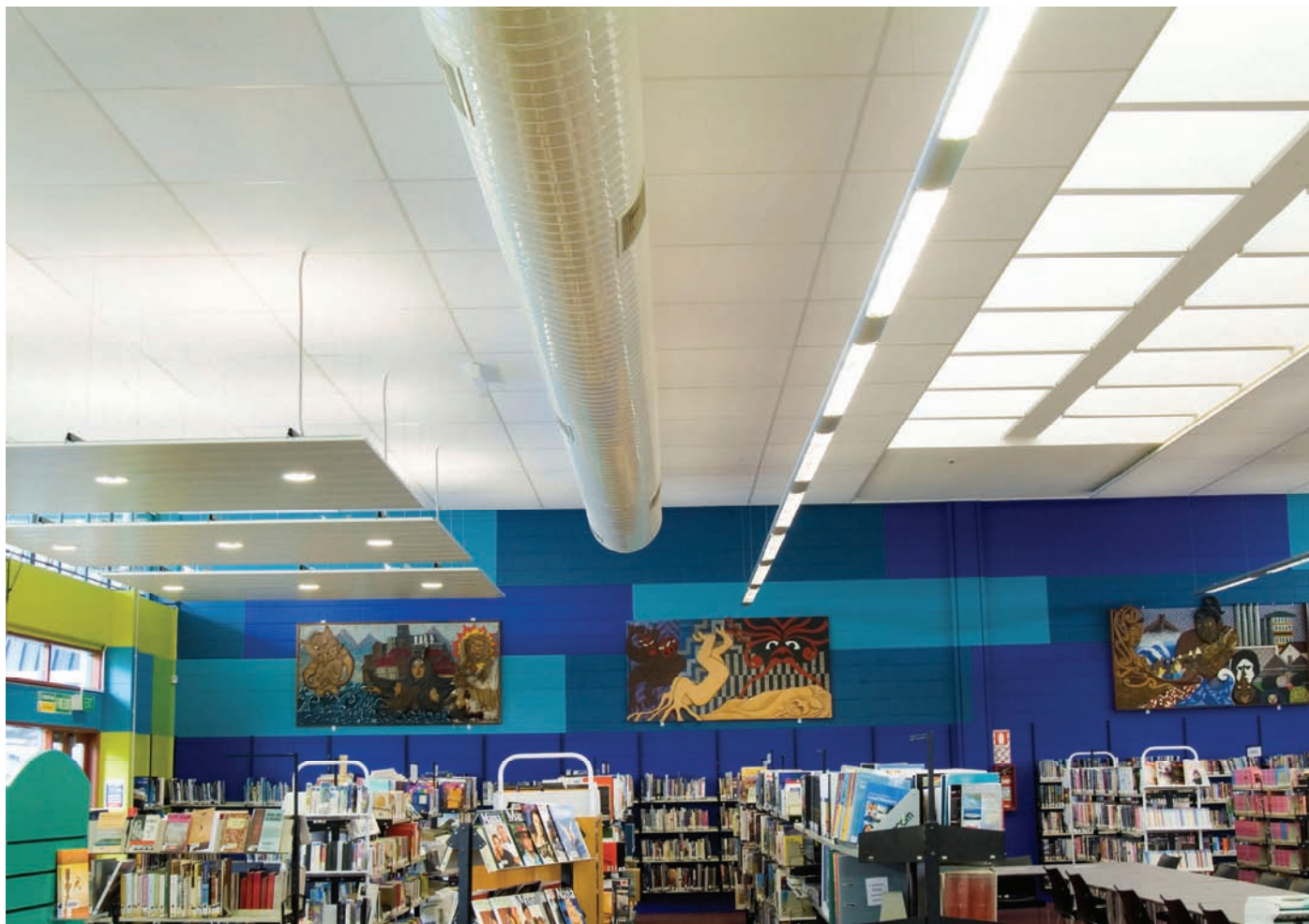
Top: Otara library, 1200 x 1200 mm Triton 25 composite soft fibre absorber panels on T24 grid