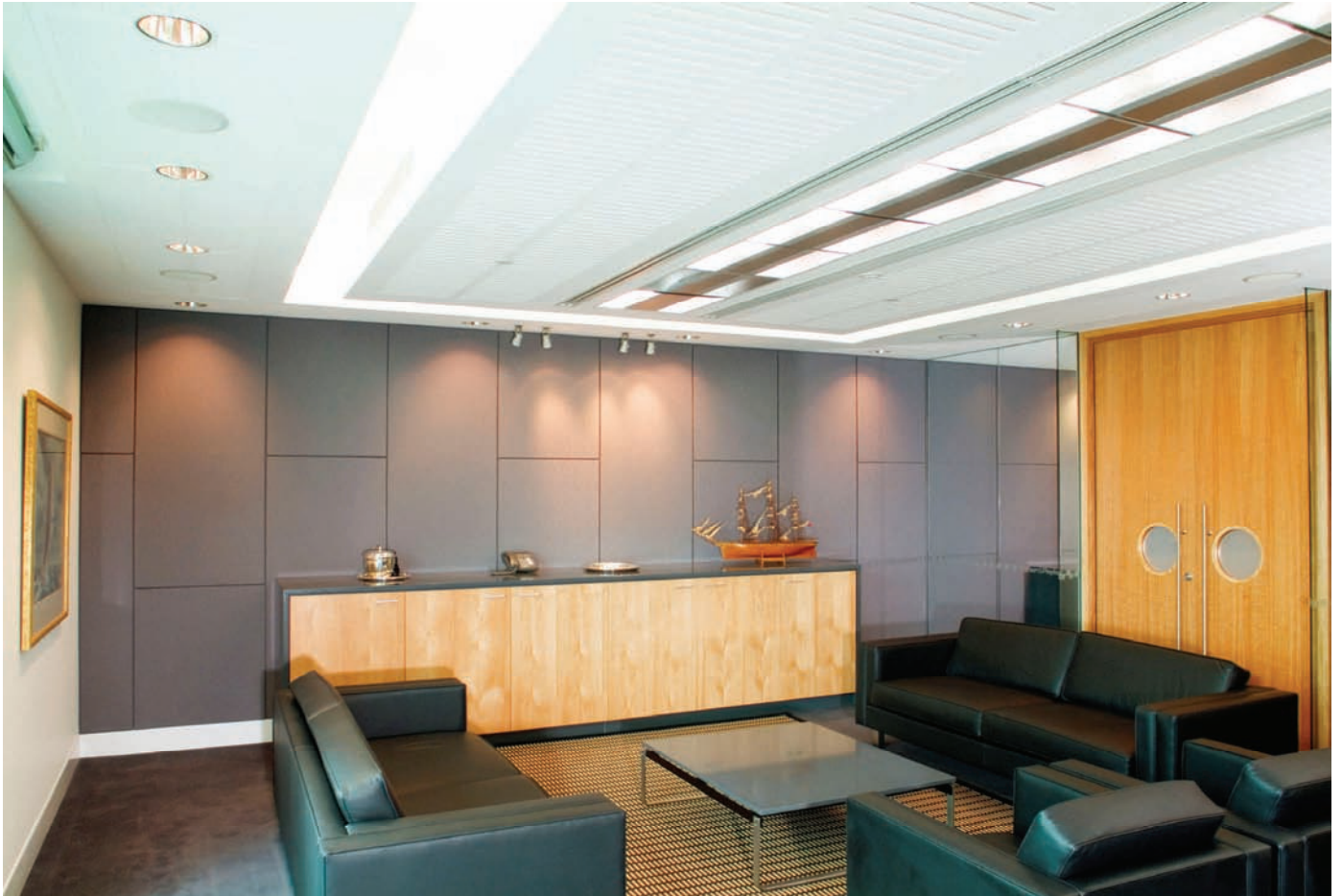
Top: Board Room, Asona Sound Soft stretch fabric wall panels and Danoline Tectopanel perforated acoustic ceiling panels