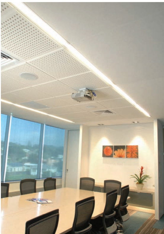
Left: Triton 25 high sound absorbing panels on TFX grid with Belgravia Q1 12 x 12 mm perforated panels over meeting room tables as decorative feature