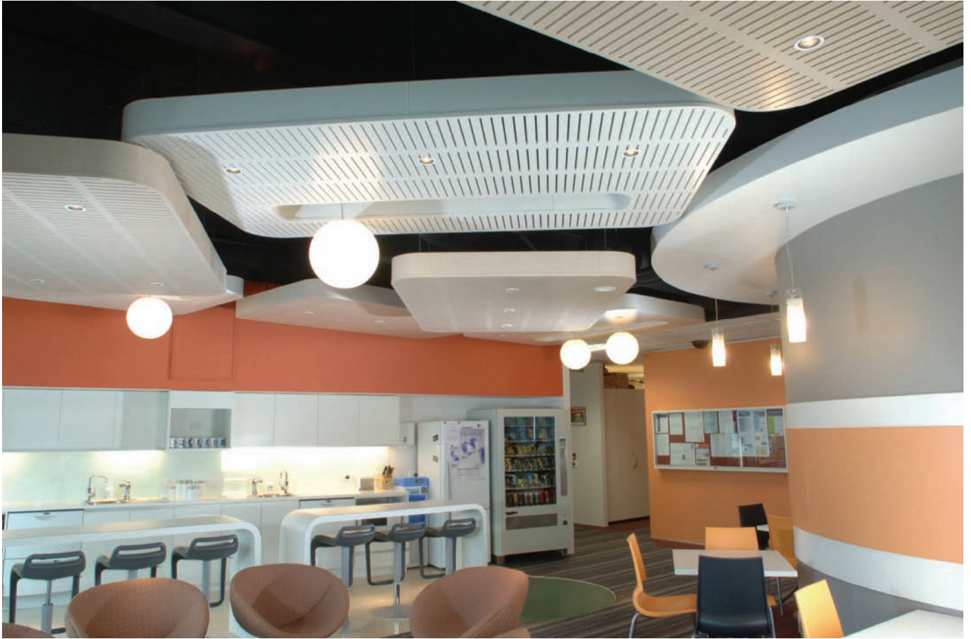
Top: Atkar AudiSlot perforated feature ceiling panels free suspended beneath mat black Triton 25 acoustic ceiling in café area