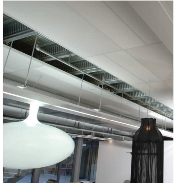
Aesthetic Lighting showroom, Auckland, Triton two tone panels, 1200 x 300, 1200 x 600 mm on T15 grid