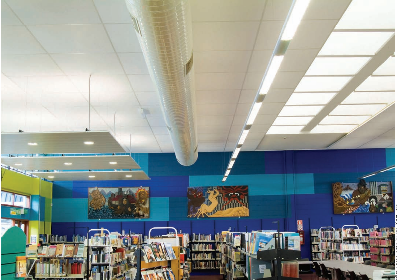
Orara Library, Triton 25, 1200 x 1200mm, DX grid