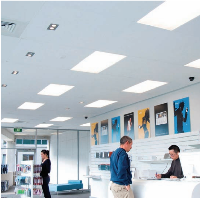
Coda Digital Music shop, Triton 25, 1200 x 1200 on TFX tissue faced grid